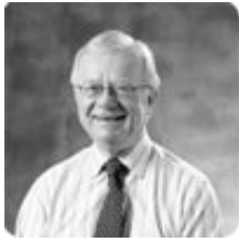
The Rt. Hon. Sir John Chilcot GCB, MA Chairman of Building and Civil Engineering Holidays Scheme Management Limited (BCEHSML)

The following are Trustees of The Building and Civil Engineering Charitable Trust;